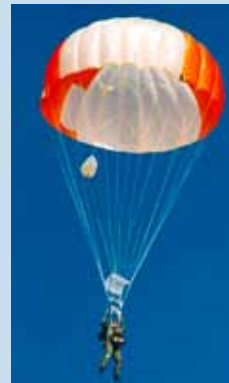
26 ft (8 m) diameter extended skirt Durachute® canopy