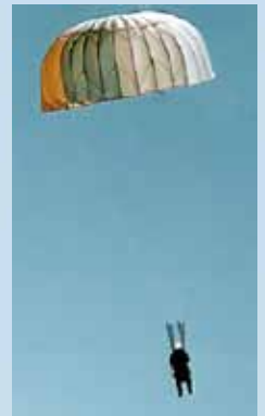
28 ft (8.5 m) diameter flat circular C-9 canopy

Durachute® is a registered trademark of BAE Systems.