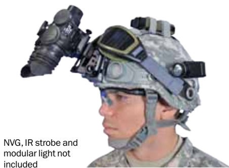
NVG, IR strobe and modular light not included

Attachments come in combination sizes of small/medium and large/extra large.